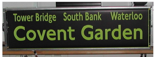
Clear text with large information content

Unique stable and reliable. Precise optical position-system.